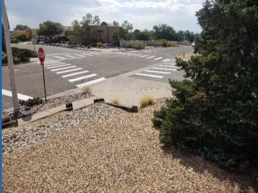
Indian School and Monte Largo